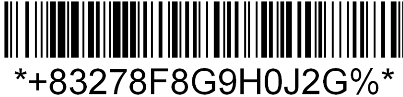
Figure 5. Code 128

Shown below are the symbols for the HIBC LIC Secondary Code Data Structure. They are based on the primary message in example 4.3.1, +A123BJC5D6E71G. In this case, the Link character ('L' in table 3) is G, and the Check character in the example below is %.