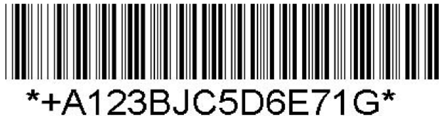
Figure 2. Code 39

Note: the figures in this document are here as examples only, and due to the nature of the document their resolution may not conform to the specifications that are needed when using these symbols in a working environment