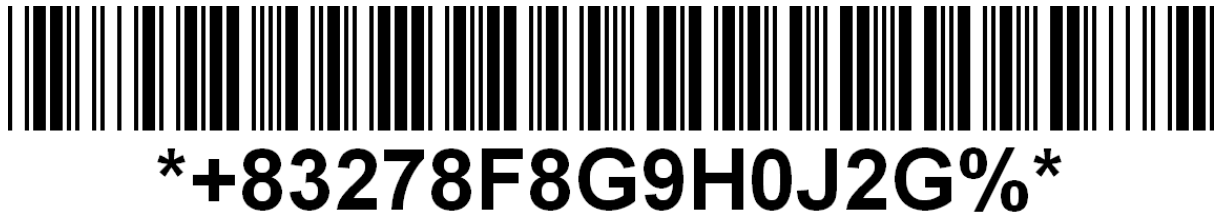
Figure 6. Code 39